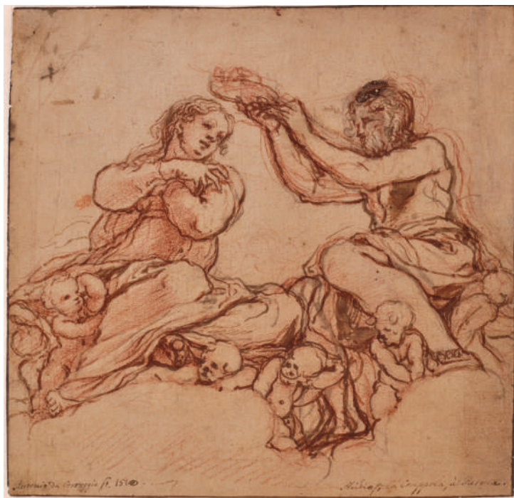
11. Correggio (1489-1534) Study for the Coronation of the Virgin , c. 1520-22 Red chalk, pen, brush and brown ink. – 196 x 203 mm Museum Boijmans Van Beuningen, Rotterdam. Loan Stichting Museum Boijmans Van Beuningen (former Koenigs collection), inv. no. I 381

A MONG THE LARGE VARIETY of collections held by Museum Boijmans Van Beuningen in Rotterdam can be found one of the most noteworthy holdings of Old Master Drawings in the world. Eager to introduce this prestigious collection to a wider public, the Fondation Custodia is proud to present a selection of 120 of the finest fifteenth- and sixteenth-century Italian drawings from the Rotterdam museum.