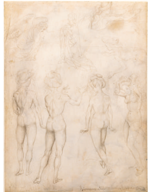
1. Pisanello (c. 1395-1455) Four Studies of a Female Nude, an Annunciation and Two Studies of Women Swimming , c. 1431-32 Pen and brown ink on parchment. – 223 x 167 mm Museum Boijmans Van Beuningen, Rotterdam. Loan Stichting Museum Boijmans Van Beuningen (former Koenigs collection), inv. no. I 520

were the principal hubs of artistic creation at the time and indeed dominate the Rotterdam collection. The museum is famous for its exceptional collection of 400 drawings by the Florentine painter Fra Bartolommeo (fig. 7), thirteen of which will be presented in Paris. Venice is not far behind and the exhibition contains work by its greatest representatives: Vittore Carpaccio (fig. 3), Gentile Bellini, Veronese, Jacopo Tintoretto and their workshops, as well as that of the Bassano family.