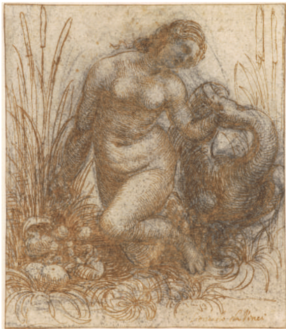
4. Leonardo da Vinci (1452-1519) Leda and the Swan , c. 1505-07 Black chalk, pen and brown ink. – 128 x 109 mm Museum Boijmans Van Beuningen, Rotterdam. Loan Stichting Museum Boijmans Van Beuningen (former Koenigs collection), inv. no. I 466

Drawings made by some of the early fifteenth-century precursors of the Italian Renaissance, today of the greatest rarity, are one of the salient features of the collection of Museum Boijmans Van Beuningen. Several studies by Pisanello (fig. 1), Parri Spinelli and Benozzo Gozzoli open the exhibition in an impressive way. From then on, the pre-eminent centres of Florence and Venice take over. These