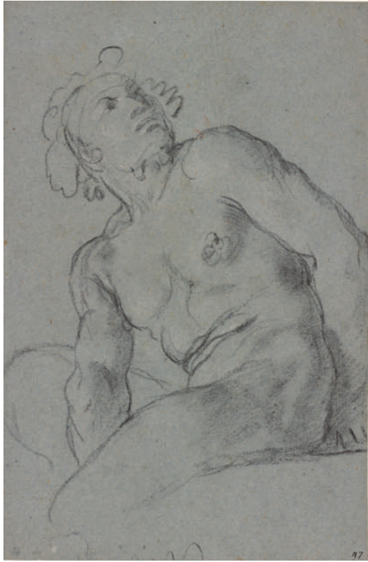
14. Annibale Carracci (1560-1609) Study of a Seated Male Nude , c. 1595-1600 Black chalk, heightened with white, on blue paper. – 336 x 221 mm Museum Boijmans Van Beuningen, Rotterdam. Loan Stichting Museum Boijmans Van Beuningen (former Koenigs collection), inv. no. I 183

ends with drawings by the generation of artists active at the end of the sixteenth century and the turn of the seventeenth, including Federico Barocci (fig. 13), the Zuccari, Cavaliere d'Arpino and the Carracci (fig. 4).