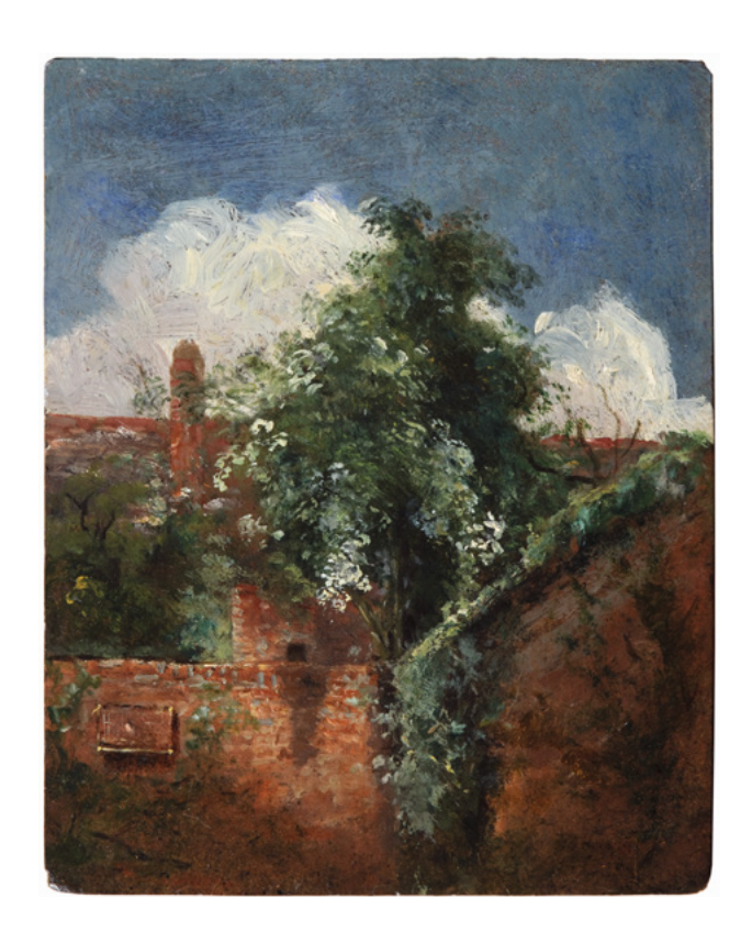
15. John Constable (East Bergholt 1776 – 1837 London) View of Gardens at Hampstead, with an Elder Tree, c. 1821-22 Oil on cardboard. – 17,6 × 14 cm Fondation Custodia, Collection Frits Lugt, Paris, inv. 2019-S.58