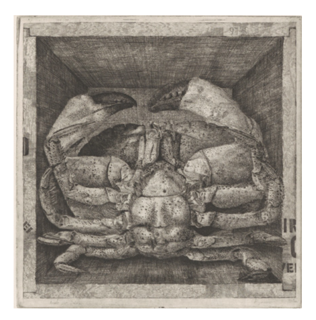
20. Charles Donker (born in Utrecht in 1940) Crab ("Cancer Pagurus") in a Box , 1971 Etching; third state. - 204 × 200 mm (platemark); 392 × 282 mm (sheet) Fondation Custodia, Collection Frits Lugt, Paris, inv. 2015-P.23