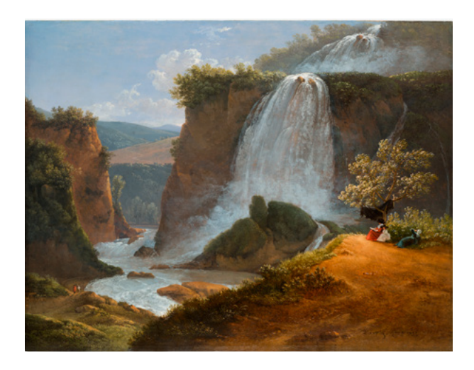
12. Simon Denis (Antwerp 1755 – 1813 Naples) The Waterfall of Tivoli, with Élisabeth Vigée Le Brun Drawing, 1790 Oil on panel. – 48,3 × 62,1 cm Fondation Custodia, Collection Frits Lugt, Paris, inv. 2021-S.62