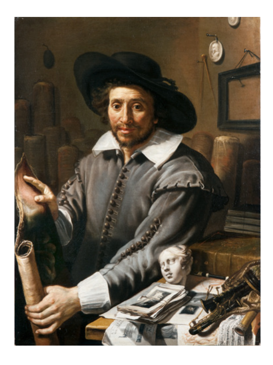
9. French or Italian artist, XVII<sup>th</sup> century Portrait of François Langlois, called Ciartres, c. 1630-35 Oil on canvas. – 91,5 × 68,5 cm Fondation Custodia, Collection Frits Lugt, Paris, inv. 2010-S.61

7. Wenceslaus Hollar (Prague 1607 – 1677 London) Commercial Top-Shell (Trochus Niloticus L.), c. 1646 Etching. – 95 × 144 mm Fondation Custodia, Collection Frits Lugt, Paris, inv. 2020-P.42