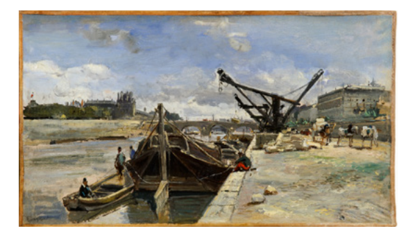
14. Johan Barthold Jongkind (Lattrop 1819 – 1891 La Côte-Saint-André) View of the Quai d'Orsay in Paris , c. 1850-52 Oil on paper, laid down on canvas. – 21,3 × 37,3 cm Fondation Custodia, Collection Frits Lugt, Paris, inv. 2012-S.15

(Paris 1796 – 1875 Ville-d'Avray) A City Suburb (Rochefort-sur-Mer, Charente), 1851 Oil on paper, laid down on canvas. – 24,5 × 38 cm Fondation Custodia, Collection Frits Lugt, Paris, inv. 2013-S.29