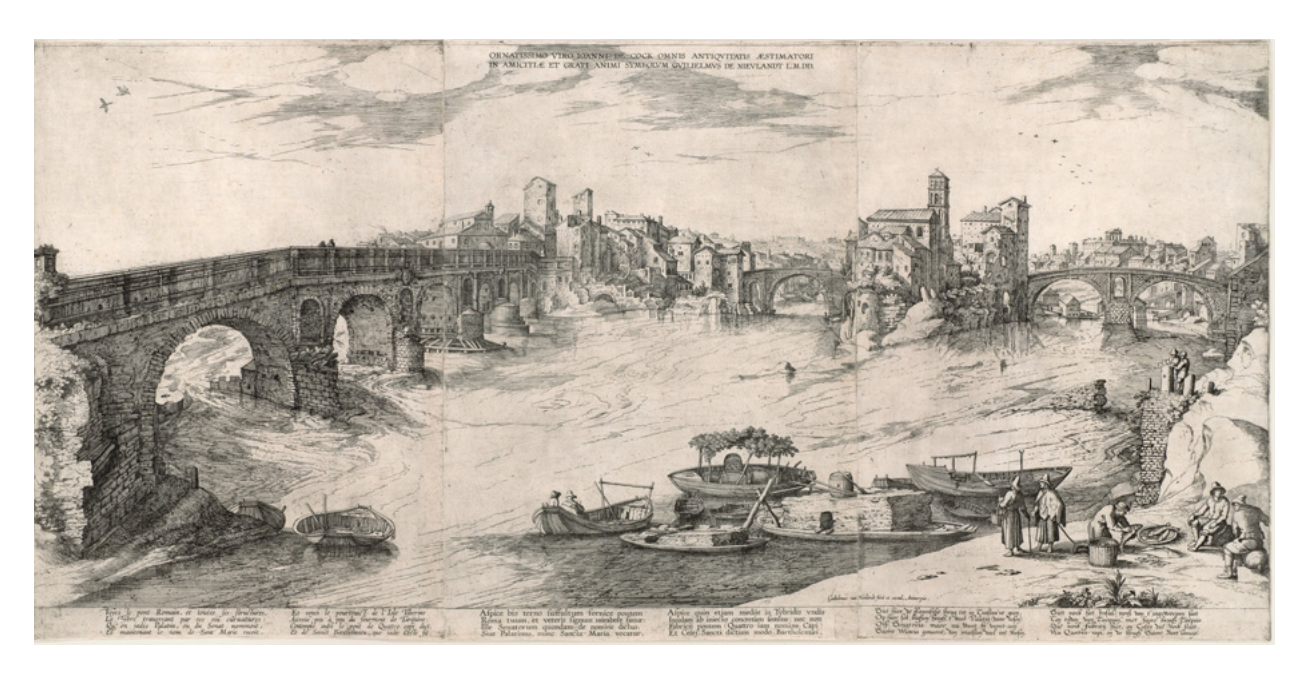
6. Willem van Nieulandt (Antwerp 1584 – 1635 Amsterdam) Grand View of Rome with Tiber Island, c. 1605-10(?) Etching from three plates; 420 × 873 mm (plates); 422 × 877 mm (joined sheets) Fondation Custodia, Collection Frits Lugt, Paris, inv. 2021-P.6

The Fondation Custodia is proud to possess some rare proofs of prints of which only a few copies have come down to us. For instance, Girl at a Window , a burin engraving by an anonymous sixteenth-century German artist, one of the four known copies of this plate. The meaning of this work remains enigmatic but seems to evoke the fragility of life. The spectacular Grand View of Rome with Tiber Island , signed by Willem van Nieulandt (1584-1635) spreads over three engraved pages [fig. 6]. Following the Flemish tradition, Van Nieulandt adds several genre figures in this urban view, including fishermen examining their catch and, in the centre, seated in a small boat, a draughtsman seen from behind: perhaps a veiled self-portrait? The lettering in three languages suggest an international public for this ambitious print of which very few copies survive today.