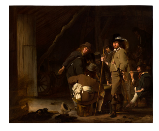
10. Simon Kick (Delft 1603 – 1652 Amsterdam) Genre Scene with Soldiers Playing Dice, c. 1645-50 Oil on panel. – 74,6 × 91,4 cm Fondation Custodia, Collection Frits Lugt, Paris, inv. 2021-S.63

8. Johan Gudmann Rohde (Randers 1856 – 1935 Hellerup) Young Girl Sewing, 1893 Lithography printed on chine collé. – 33,6 × 32,7 cm (platemark); 38 × 37,5 cm (sheet) Fondation Custodia, Collection Frits Lugt, Paris, inv. 2021-P.5