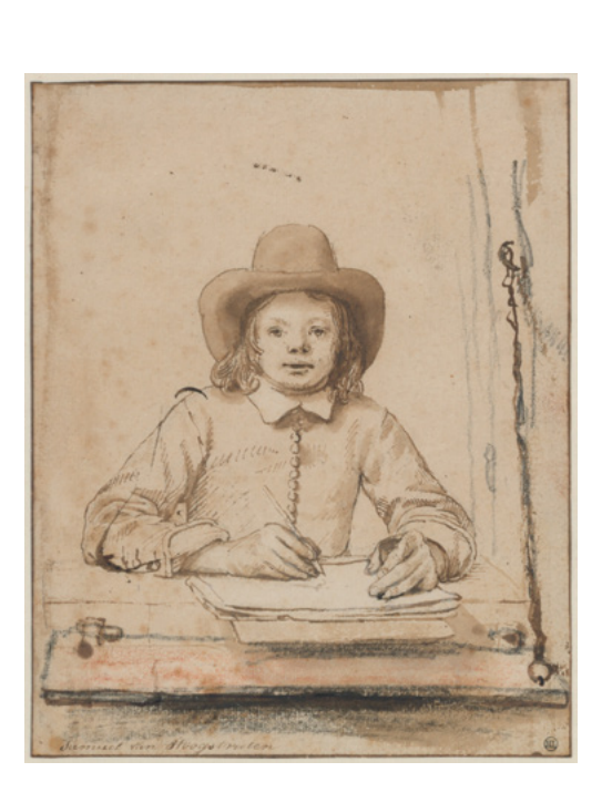
3. Samuel van Hoogstraten (Dordrecht 1627 – 1687 Dordrecht) Self-Portrait at a Window , c. 1642-43 and 1650 Pen and brown ink, with brown wash, over traces of black chalk; corrections in pen and brown ink probably by Rembrandt; later additions by the artist in black and red chalk and pen and brown ink. – 170 × 135 mm Fondation Custodia, Collection Frits Lugt, Paris, inv. 2012-T.4