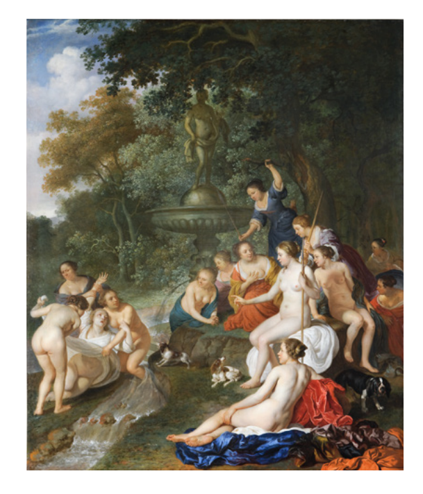
11. Jacob van Loo (Sluis 1614 – 1670 Paris) Diana and Callisto Oil on canvas. – 99,1 × 81,3 cm Fondation Custodia, Collection Frits Lugt, Paris, inv. 2013-S.23