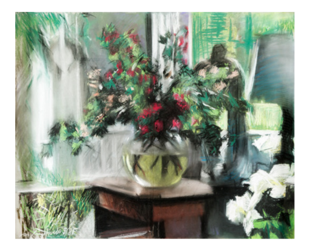
19. Jozef Van Ruyssevelt (Bazel, Belgium 1941 – 1985 Kalmthout) The Glass Globe , 1981 Pastel (two sheets joined horizontally). – 800 × 1000 mm Fondation Custodia, Collection Frits Lugt, Paris, inv. 2016-T.130

18. Gèr Boosten (born in Maastricht in 1947) Sketchbook Poilly-lez-Gien, 2013 Pen and black and red ink. – 206 × 293 mm Fondation Custodia, Collection Frits Lugt, Paris, inv. 2016-T.36