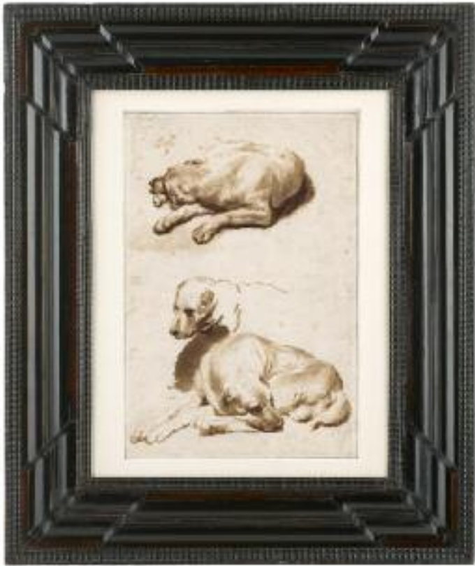
Germany (?), 17 th century, ebonised wood frame

Materials and techniques: ebonised fruitwood frame with applied ripple mouldings bordering scotia and ogee profiles, stepped in at the corners, on a “mortise and tenon” conifer back frame, which is bevelled to give the frame a lighter appearance.