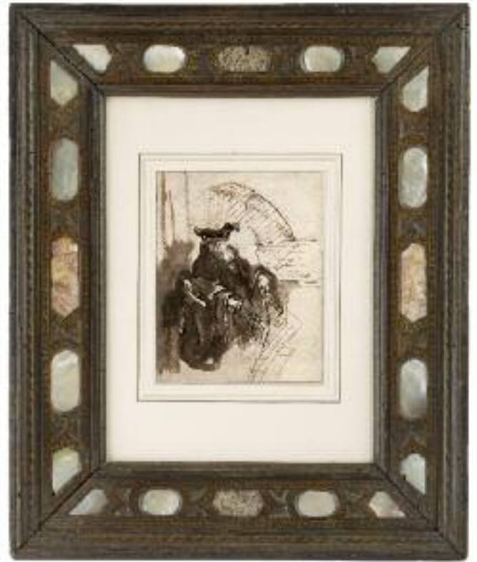
Italy, 16 th century, cassetta frame

Drawing: Gerbrand van den Eeckhout, Studies of a dog lying down ; point of the brush in brown ink, brown wash. – 293 × 199 mm [no. 31; cat. 70]